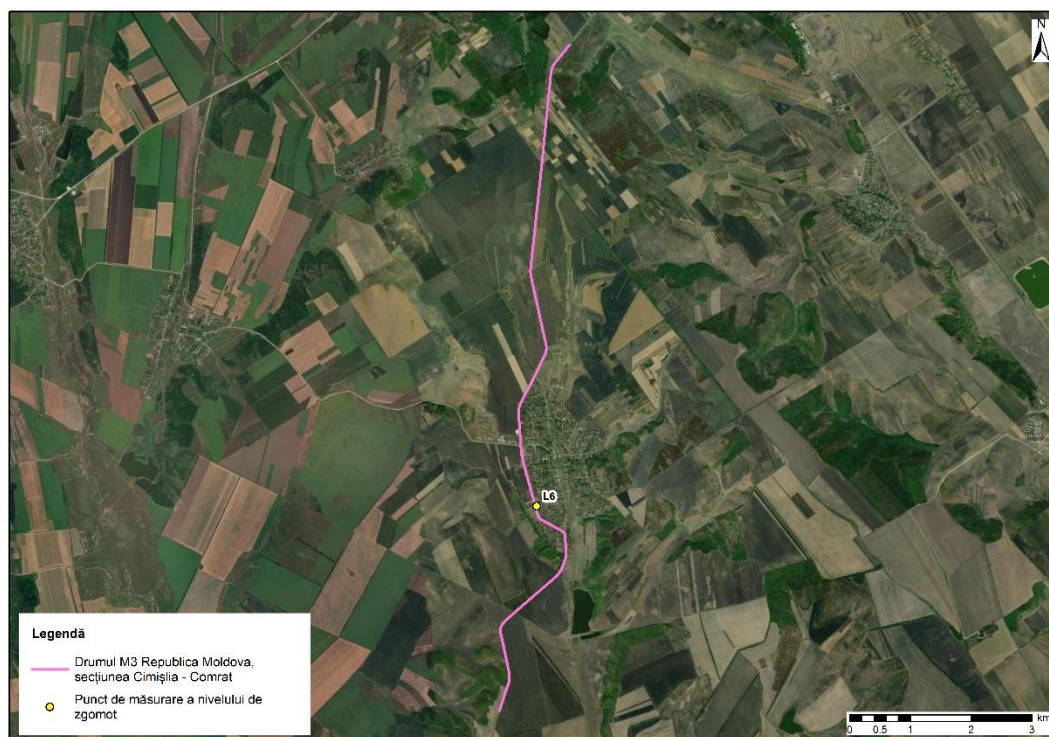
Figure1 – Location of the ambient noise measurement points used to characterize the existing acoustic conditions